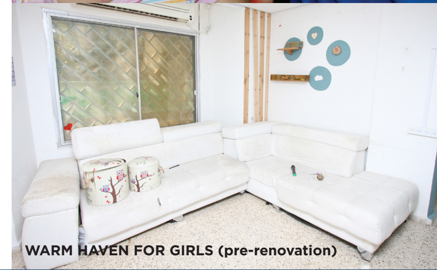
WARM HAVEN FOR GIRLS (pre-renovation)