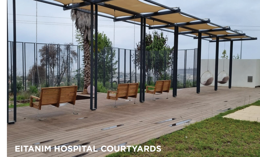
EITANIM HOSPITAL COURTYARDS