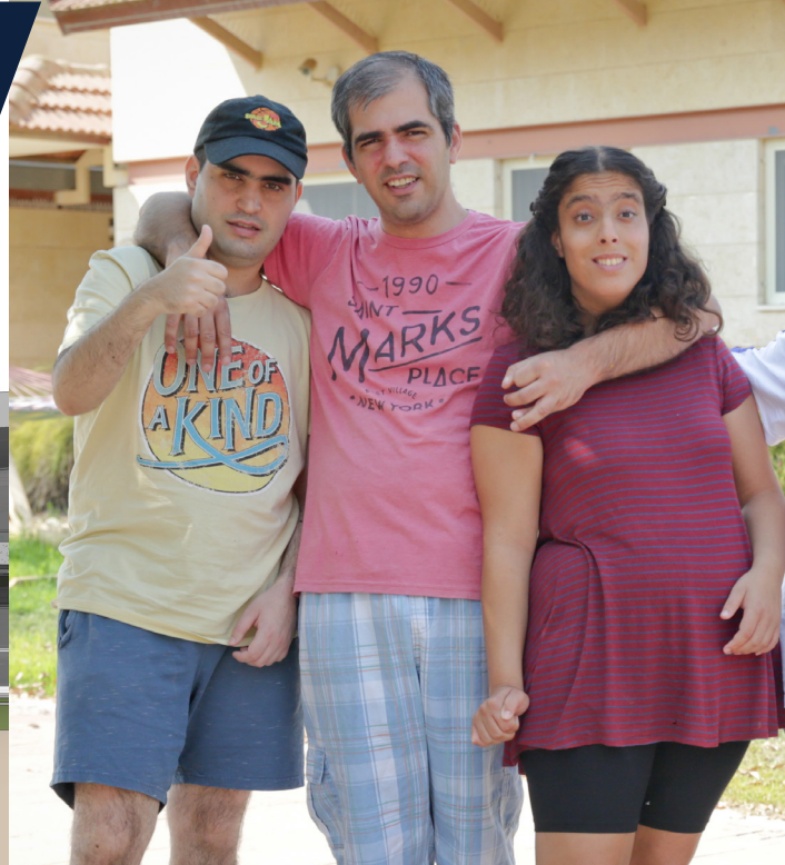
AVIV HOUSE FOR YOUNG ADULTS WITH ASD