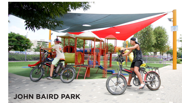
JOHN BAIRD PARK