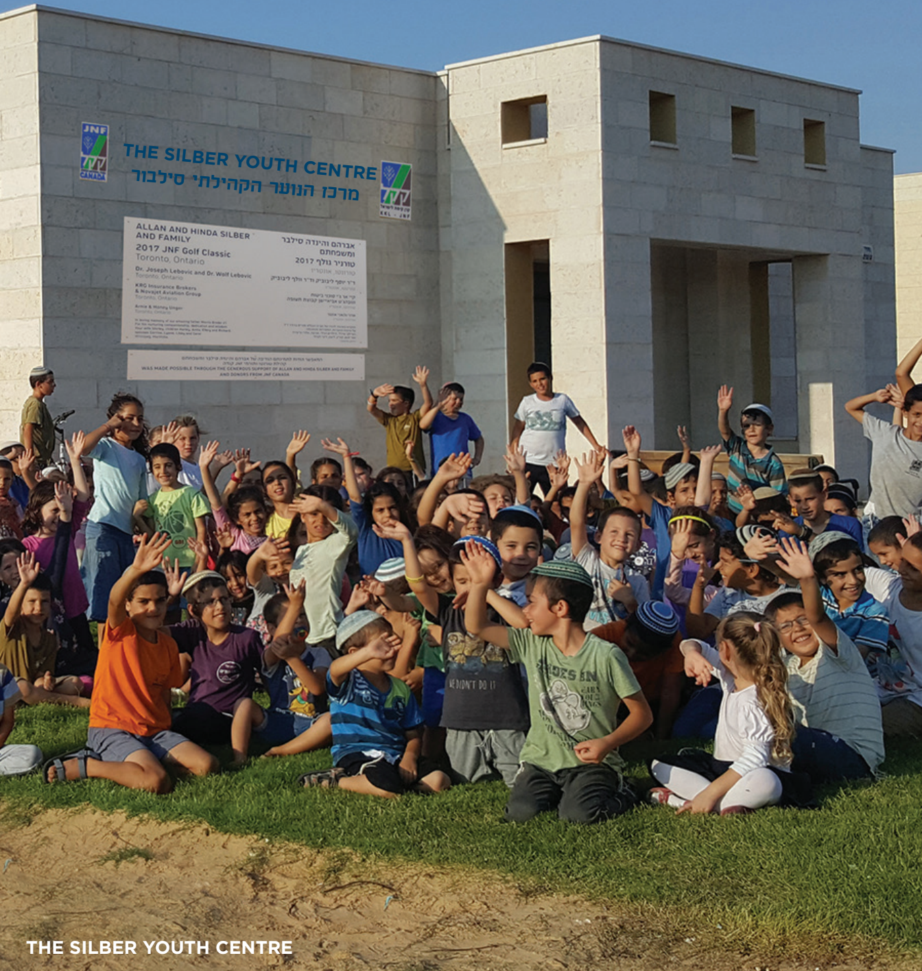
THE SILBER YOUTH CENTRE

Close to the border of Egypt and Gaza lies the Haluza region, in the Negev desert. In 2005, when Israel disengaged from the Gaza strip, 17 settlements were relocated from Gaza to Haluza and more than 8,500 residents began the hard work of rebuilding their lives in a completely new place. The area was destitute and remote, and the residents took on a pioneering role to bring this corner of the Negev to life. Haluza means pioneer in Hebrew.