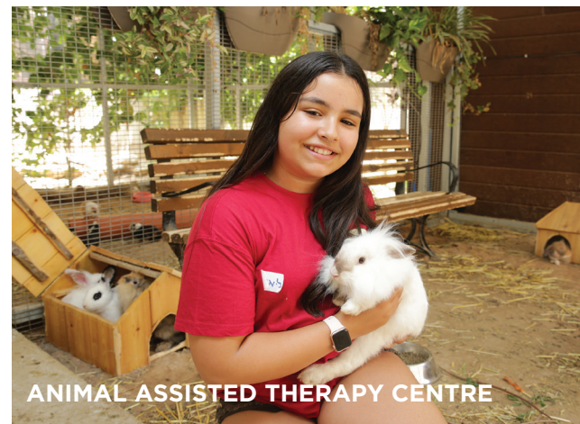
ANIMAL ASSISTED THERAPY CENTRE

Rebuilding their lives - a great challenge on its own - was made harder by the dangers of their location. Only a few kilometers away, Gaza launches regular attacks on these communities, resulting in unbearably high numbers of residents (particularly children) suffering from PTSD, stress and anxiety.