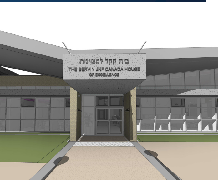
THE BERVIN JNF CANADA HOUSE OF EXCELLENCE