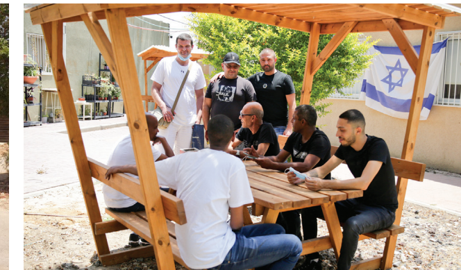
Garden at The Hosen Drug Centre

The Lavi Field and Forest Center provides fun, hands-on outdoor education, and overnight accommodations for 500 students and teachers at once. Here, students learn about the wonders of ecology and the land of Israel, all in the fresh air and cool shade of the oaks and pines. Engaging youth in environmental issues is a crucial step towards a climate-resilient future. They will be the next champions of our environment. Thanks to a JNF Builder, the cabins were upgraded to be more modern, safe, accessible, and accommodate larger groups of students.