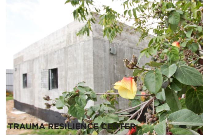
TRAUMA RESILIENCE CENTER

The need for community building was great, and JNF identified priority projects and undertook fundraising efforts to connect Canadians with this region. For several communities in the area - B’nei Netzarim, Naveh, Shlomit - they needed schools, shelters, parks, and of course, trees. Since then, thanks to our incredible donors, JNF Canada has funded many diverse projects in the region, including several safety shelters, and has become a recognizable and welcome name for residents and the community.