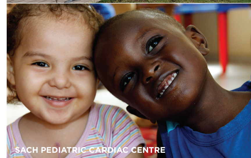
SACH PEDIATRIC CARDIAC CENTRE