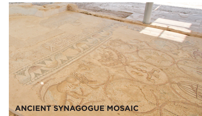
ANCIENT SYNAGOGUE MOSAIC

Haluza lies on the border of Egypt (to the south-west), and Gaza (to the north-west). Some communities are less than 2km from the border.