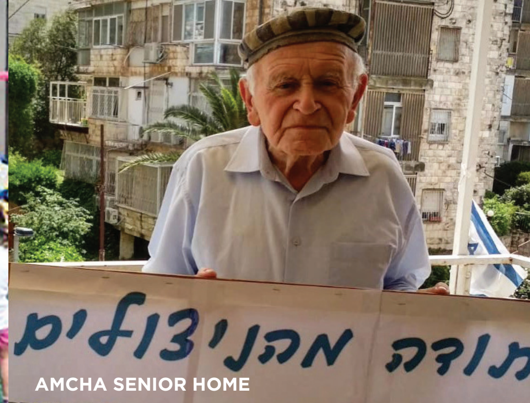
AMCHA SENIOR HOME