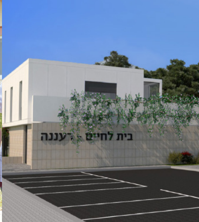
HOME FOR LIFE FOR YOUNG ADULTS WITH ASD