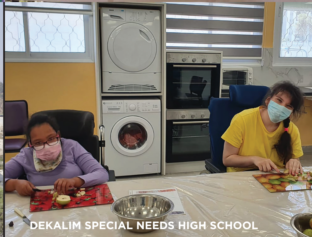
DEKALIM SPECIAL NEEDS HIGH SCHOOL