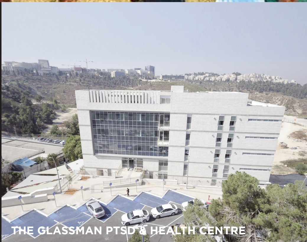
THE GLASSMAN PTSD & HEALTH CENTRE