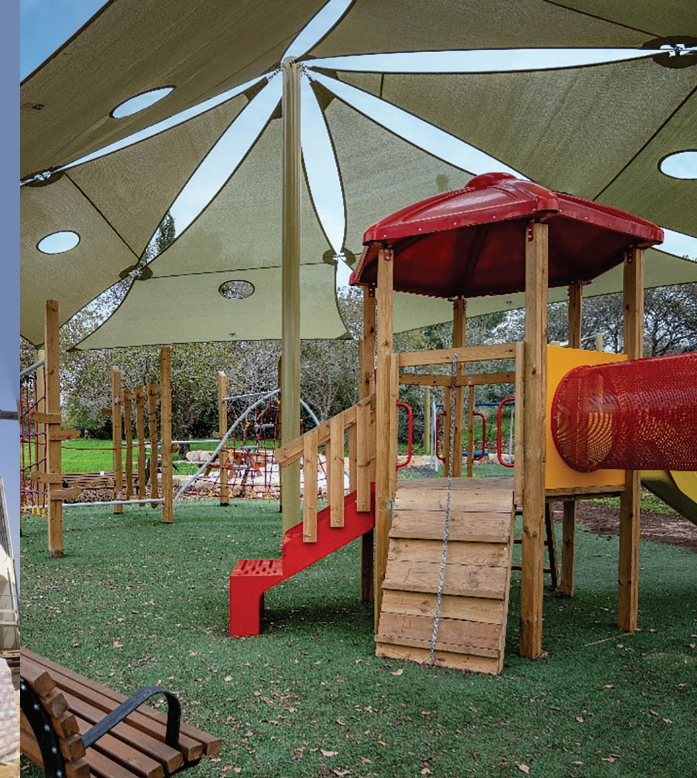
KIBBUTZ AMIR PLAYGROUND