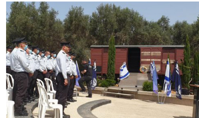
Holocaust Remembrance at Beit Haedut

Beit Haedut museum serves as a powerful symbol of resilience - it was built by Holocaust survivors almost 30 years ago. It's 10,000s of visitors learn about the atrocities in this dark period of Jewish history, connect more deeply with the subject, and meet survivors. Recently, the museum received a train car from Germany that was used to transport Jews to extermination camps. Thanks to a JNF Builder, the train car now stands as an open-air exhibit, where visitors can enter the wagon and connect to their feelings and emotions.