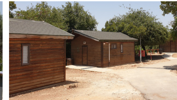
Lavi Field & Forest Cabins

Beit Haedut museum serves as a powerful symbol of resilience - it was built by Holocaust survivors almost 30 years ago. It's 10,000s of visitors learn about the atrocities in this dark period of Jewish history, connect more deeply with the subject, and meet survivors. Recently, the museum received a train car from Germany that was used to transport Jews to extermination camps. Thanks to a JNF Builder, the train car now stands as an open-air exhibit, where visitors can enter the wagon and connect to their feelings and emotions.