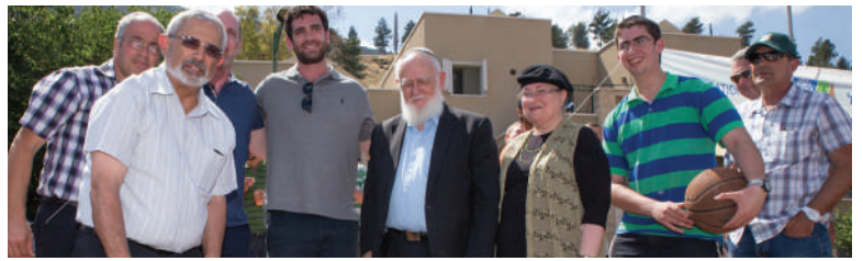
THE BALABAN BASKETBALL PARK SITE AT HESDER YESHIVA CALGARY, 2013