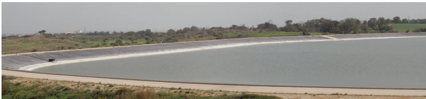
JNF OTTAWA PROJECT: YIR'ON RECYCLED WATER RESERVOIR