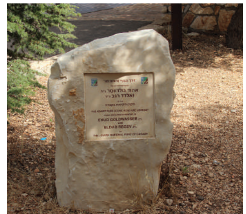
ADAMIT PARK SCENIC ROAD JNF CANADA