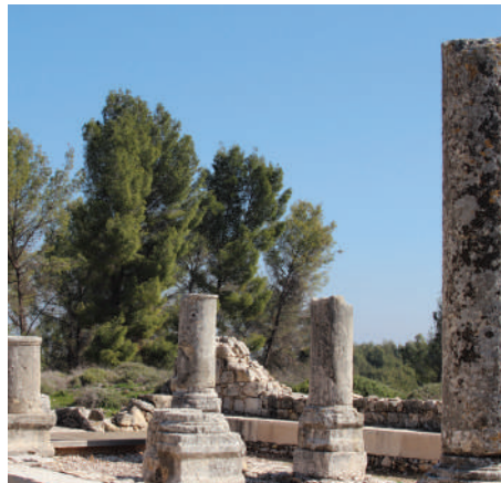
WEISZ FOREST SCENIC ROUTE SOUTHWEST ONTARIO