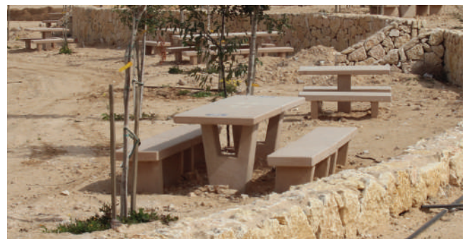
MEETING POINT PARK, IR HABAHADIM JNF CANADA