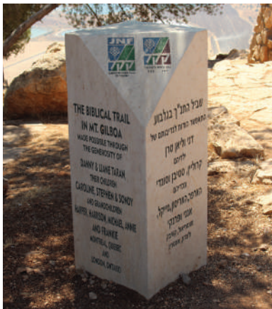
BIBLICAL TRAIL IN MT. GILBOA MONTREAL AND LONDON