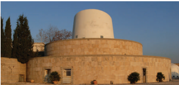
THE DOMED ASSEMBLY HALL AT YAD LAYELED VANCOUVER