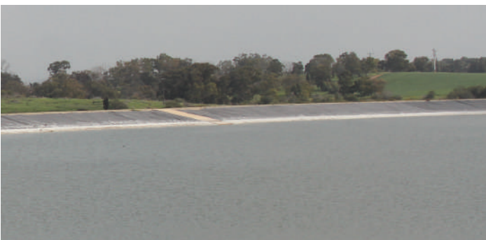
YIR'ON RECYCLED WATER RESEVOIR OTTAWA