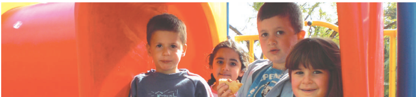
NEGEV GALA 2013 PROJECT: GEFEN AFTER SCHOOL PROGRAM FOR AT RISK YOUTH