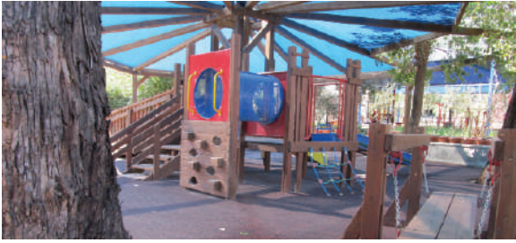
WINNIPEG SHECHAFIM SCHOOLYARD WINNIPEG 2008