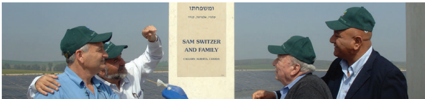
NEGEV GALA 2012 PROJECT: SDEROT RECYCLED WATER RESERVOIR