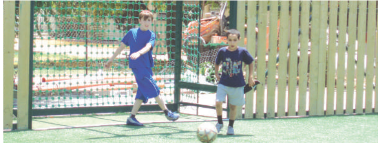
AFTER SCHOOL CARE FOR CHILDREN AT RISK IN BET SHEMESH EDMONTON